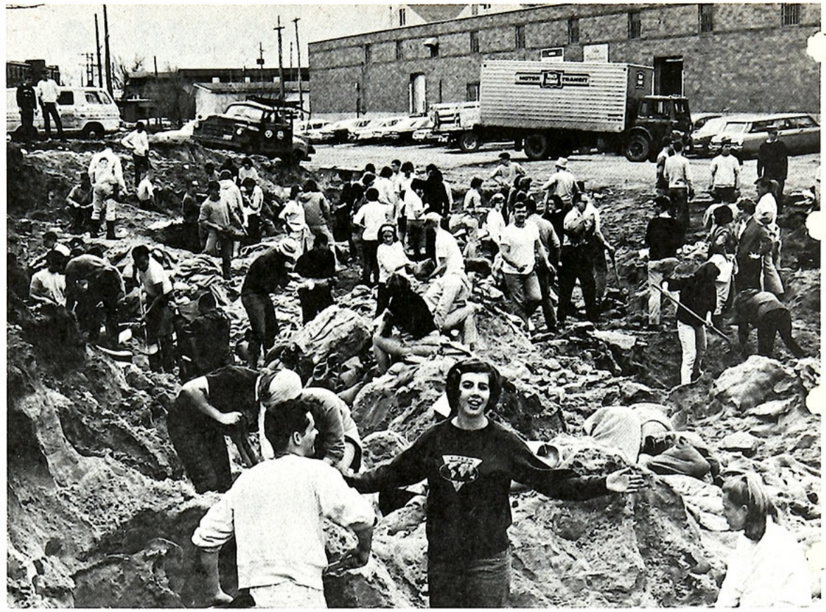
AT THE SANDPITS —This is part of the large Augie group that worked at the sandpits at 4th Ave. and 1st St., Rock Island. Augustana students gained nation-wide acclaim for their efforts in the battle against the worst flood in Quad-City history.