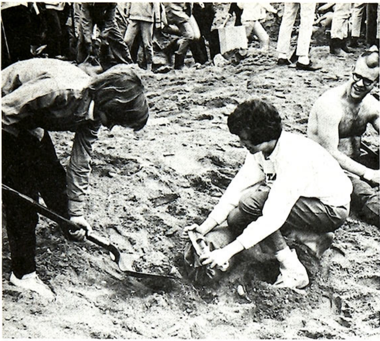
TWO AUGIE COEDS fill sandbag as a male volunteer looks on in amazement at their efforts. Coeds worked along with the men in the flood effort.