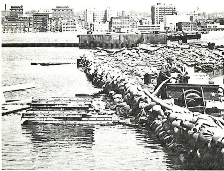
AT THE ARMORY —A secondary dike holds water which had gone past the Rock Island seawall near the Armory. A number of the Illinois National Guard pumps water which had seeped into the lower area back into the inundated city parking lot.