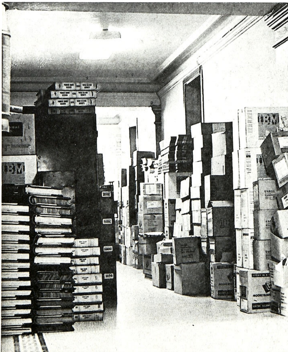
READY TO MOVE —Official documents and other material are shown stacked up at the Rock Island County Court House, where it was being kept in the event of emergency evacuation. The ground around the Centennial Bridge approach across from the court house was getting spongy with the seepage through an Augustana-built dike under the bridge.