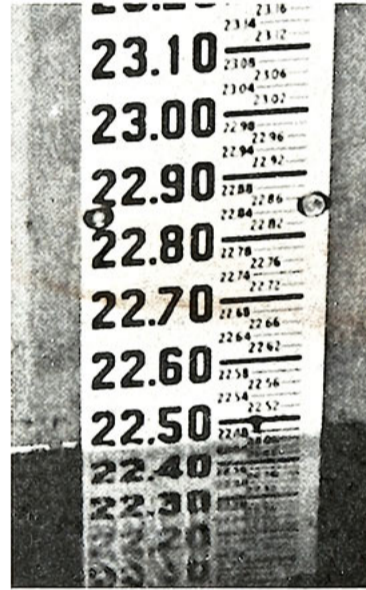
CREST: 22.48 —The official corps of engineers depth gauge on the arsenal island shows the crest Wednesday afternoon at 22.48 feet.